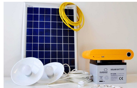
A small solar home system with panel, battery and two lamps.