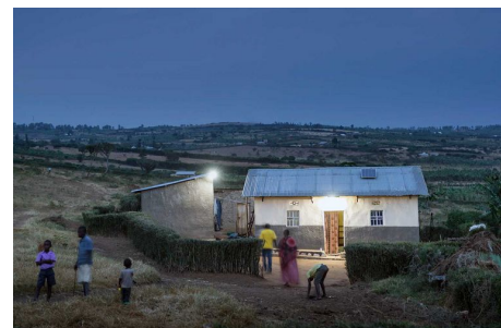
Light increases the sense of security of the rural people and allows children to do their school work even in the evening hours.